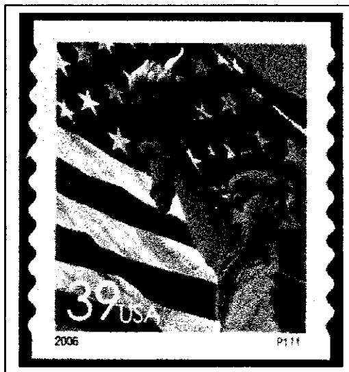
39c Lady Liberty & U. S. Flag (AP) (SA) Plate P1111 PNC ID 2006-6

This coil can be distinguished from the other self-adhesive Lady Liberty and Flag coils by its wavy die cut, the micro-printed "USPS" on the top red stripe of the flag, and by the plate numbers which all begin with the letter "P", the prefix code used by Ashton Potter.